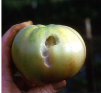
Hornworm damage on tomato

Gardeners are likely to spot the large areas of damage at the top of a plant before they see the culprit.